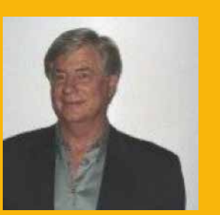
Jaguar Computer Systems, Inc.