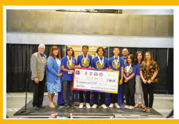
STEM PULL Students: 1st, 2nd and 3rd place winners