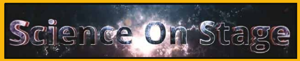
Science-on-Stage, Student STEPCon23, Bourns Technology Center, Riverside, CA. Character cards for "states of matter; solids, liquids, gas and plasma"