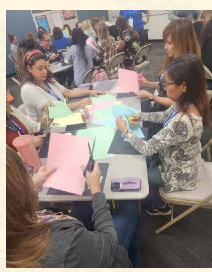
Educator STEPCon23, Workshop, Riverside, CA

ed two academies dedicated to 5th & 6th grade students (PATTERNS, PUZZLES, & PRACTICES) and 7th & 8th grade students (STEM FUNDA-MENTALS) to encourage them to learn the skills they will need for rigorous STEM majors.